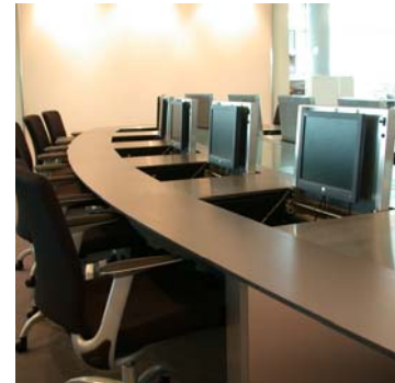
Architect: Icewit Design